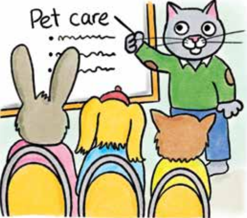
Centre for Humane Education & Wellness - Three dedicated classrooms for educational programming also available for after-hours public use