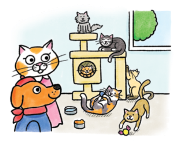
Animal Habitats - Cages replaced with clean, warm, home-like habitats for dogs, cats and small animals

The new space will be open, inviting and safe for all of our animal friends. Hurt and vulnerable animals will receive the best possible medical care in surroundings that feel (almost) like home. Also! There will be room for our human friends to learn about pets and what they will need from us when they find their forever home.