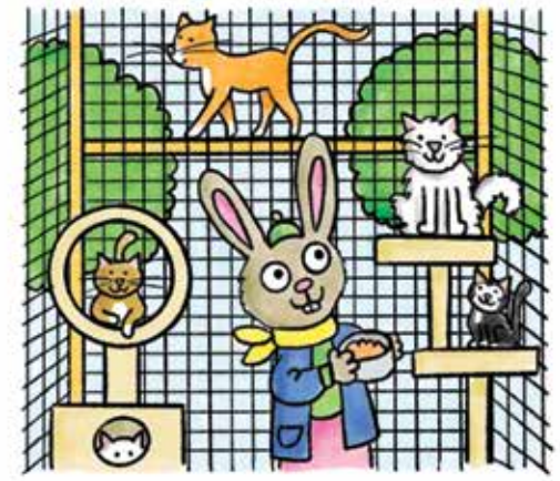
Cat Atrium - Three season Catio to provide adoptable cats with safe outdoor time for enrichment