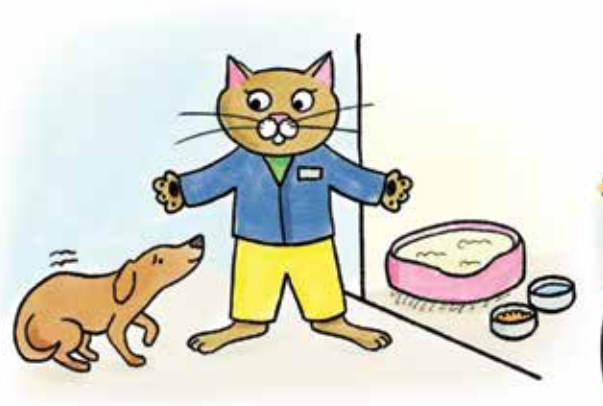
Animal Services Centre Dedicated space to accept lost or surrendered animals and provide them with comfort and care