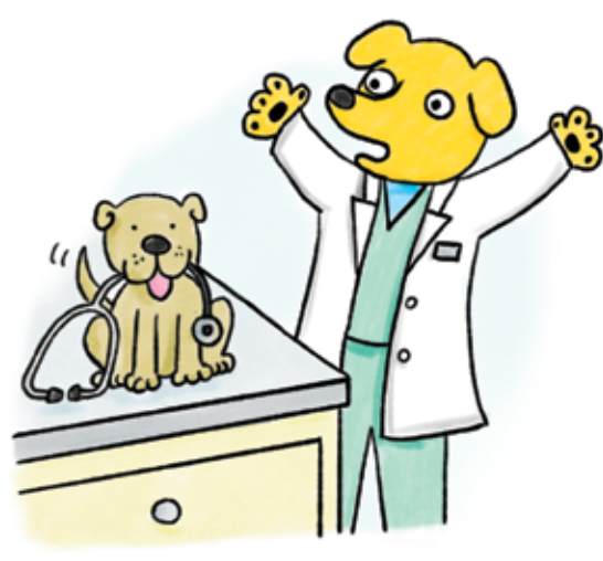
Veterinary Care Centre - Fully equipped veterinary clinic to help animals at their time of greatest need