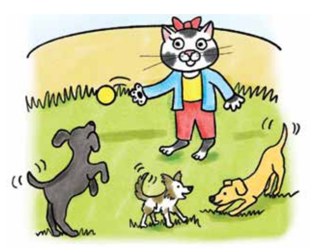
Green Spaces - Fenced and landscaped large and pint-sized dog parks